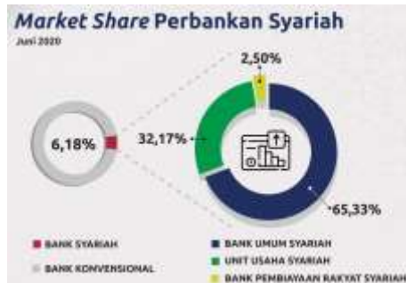
Picture 1. Syariah Banking Market Share

Units, with a total office network of 2,151 units, according to statistics as of December 2014 (Tho'in, 2016). This is quite sad and ironic, where the number of Indonesian Muslims based on the 2010 population census is 207 million (87.2%) but the market share for Islamic banks based on data per June 2020 is only 6.18% (Rohandi, 2020).