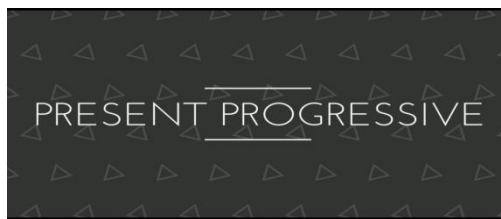
Figure 4.17 Present Progressive Tense