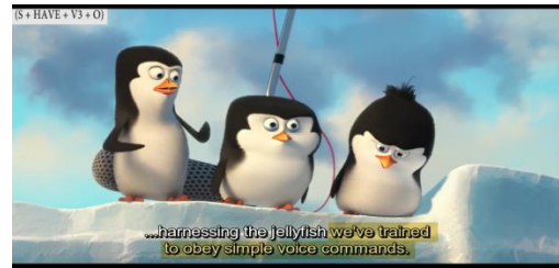
Figure 4.20 Present Perfect Tense