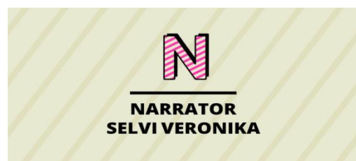
Figure 4.23 Closing of the Video