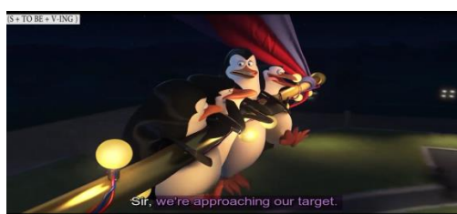
Figure 4.18 Present Progressive Tense