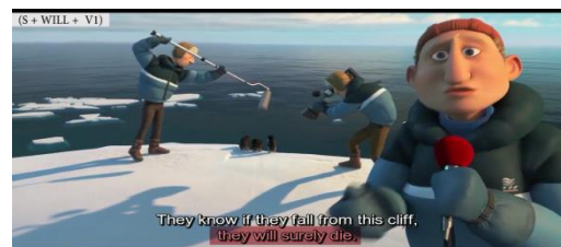
Figure 4.14 Simple Future Tense