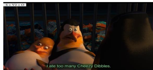
Figure 4.22 Simple Past Tense