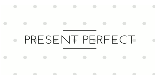
Figure 4.19 Present Perfect Tense