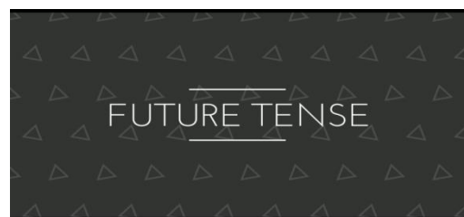
Figure 4.13 Simple Future Tense