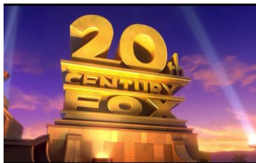
Figure 4.9 Opening of the Video

The result of the video could be see in the figure below: