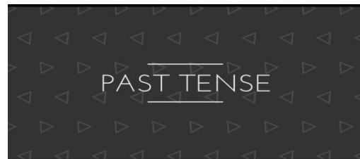
Figure 4.21 Simple Past Tense