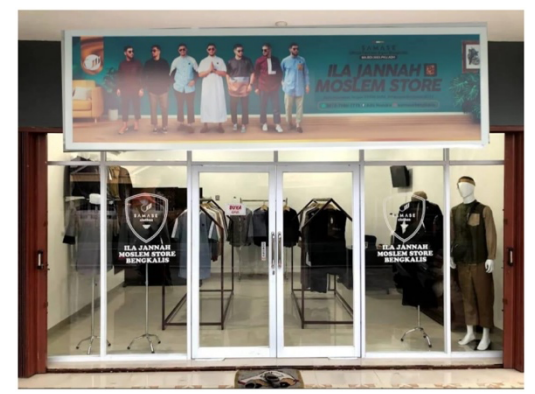
Figure 3. Ila Jannah Moslem Store at Kelapapati Tengah Street, Bengkalis