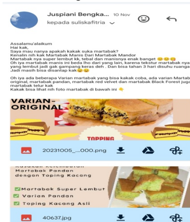
Figure 1 Marketing through E-mail Marketing